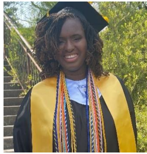
Abeni Perkins James Lewis Education & Tennis Foundation