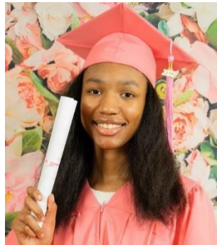
Taylor Craig James Lewis Education & Tennis Foundation